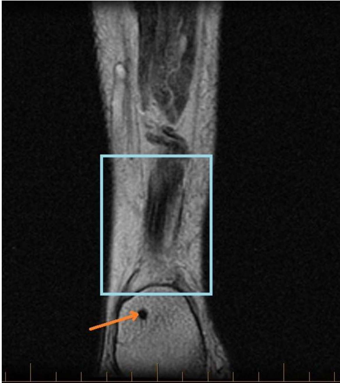
Posterior view in coronal plane

But wait! It's not all Greek here. Medial and anterior tendons intact while lateral abnormal due to 3 cm split tear (light blue box in above graphic) peroneus brevis splits retro- and inframalleolar that appears chronic. No high-grade arthrosis in articular surfaces. Also, calcaneal exostectomy (orange arrow in above graphic) has smooth appearance.